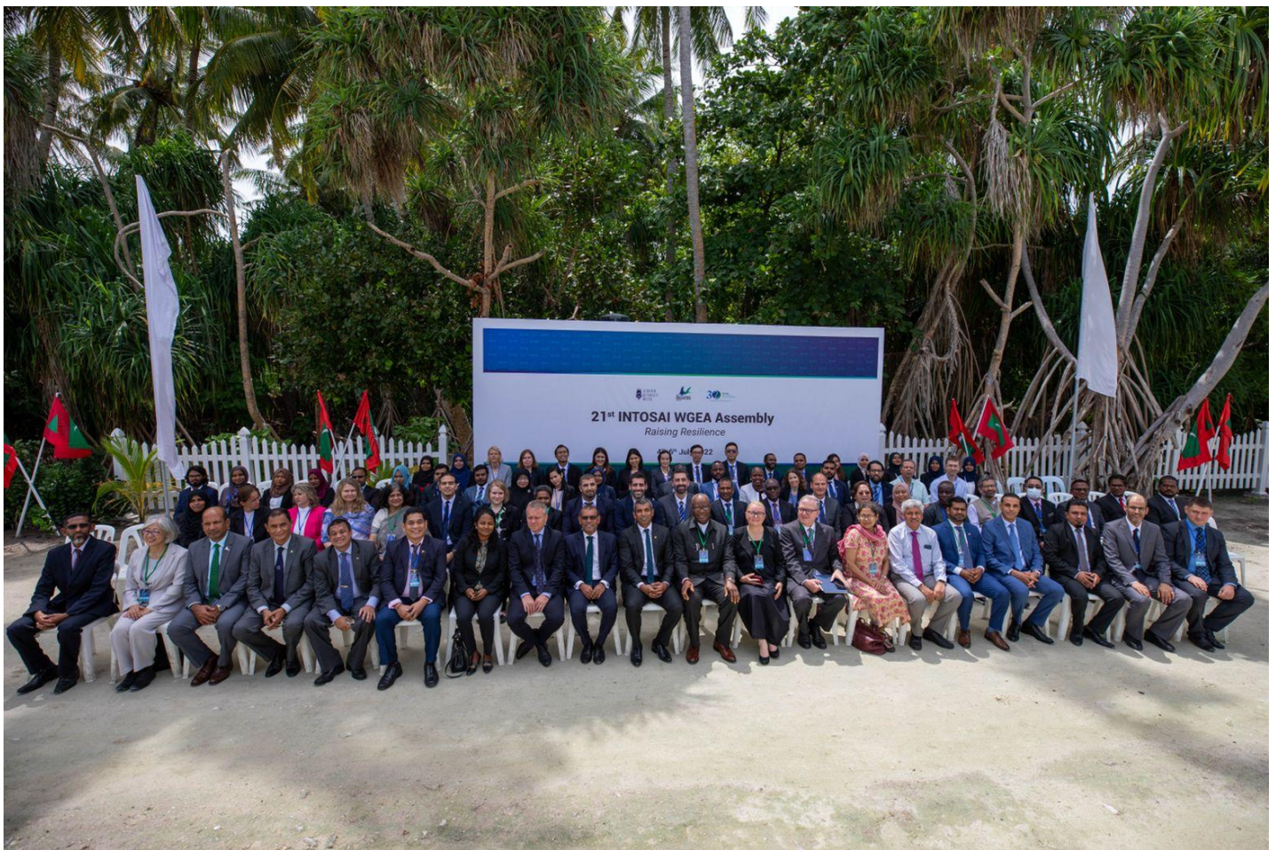
Participants of the 21 st INTOSAI WGEA Assembly in the Maldives.

The WGEA hosted its 21st Assembly in July 2022 in the Maldives. The theme of the Assembly was Raising Resilience, which aimed to look at resilience and climate change adaptation from an auditing perspective. The Maldives, being the lowest-lying country in the world, is already affected by the effects of climate change and environmental degradation. This Assembly showcased the willingness for global cooperation to address the imminent issues of small islands as well as the rest of the world. The Assembly was the first hybrid Assembly of the WGEA, gathering 80 participants in-person as well as 200 registered online participants. The WGEA has also released a Seminar Summary on Raising Resilience available to read, as well as a slider on the artistic work present during the Assembly.