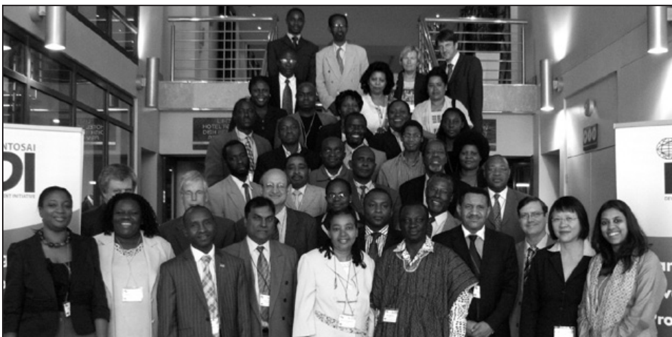
Participants in the August 2010 Management Development Program workshops in Durban, South Africa.

At the end of the workshop, delegates designed personal action plans to improve management processes in their respective SAIs and committed to submitting a report on implementation and progress by November 30, 2010.