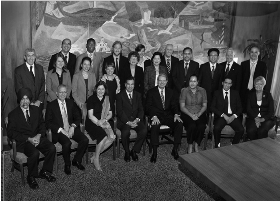
Participants in the steering committee meeting of the Capacity Building Committee in Washington, D.C.