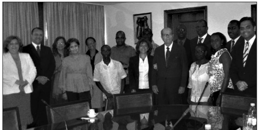
Participants in the June 2010 meeting of the CPLP in Lisbon, Portugal

E-mail: arint@tcu.gov.br Web site: www.tribunaiscplp.gov.br