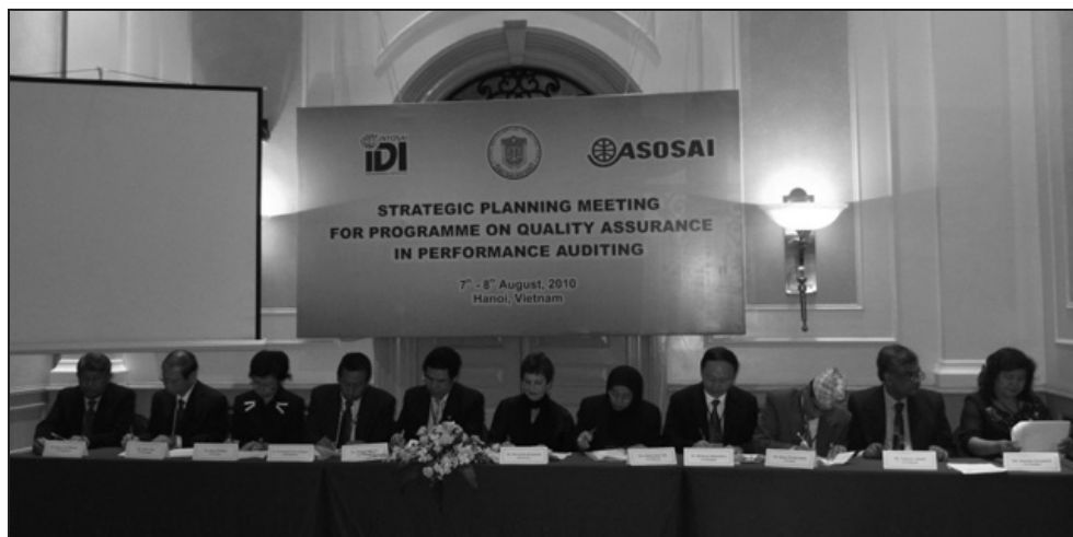
Participants in the IDI/ASOSAI strategic planning meeting in Vietnam in August 2010.

As part of the program, IDI conducted a strategic planning meeting for quality assurance in performance auditing in Vietnam in August 2010. The meeting objective was to sign cooperation agreements with each target SAI to agree on the program design, outcomes, outputs, roles and responsibilities, team composition, and risks to program success. As with similar high-level meetings for other programs, the goal was to build local ownership and commitment in the target SAIs.