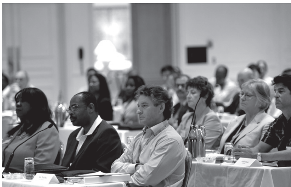
Delegates listen carefully to presentations at the Commonwealth Auditors General Conference

The concluding presentation for this subtheme introduced a research paper prepared by the Overseas Development Institute for the United Kingdom’s National Audit Office. The paper explored the effectiveness of PACs around the Commonwealth and suggested at least three key effectiveness principles: the independence of the PACs, the capacity to avoid questions of policy, and the ability of different parties to work together. A fourth principle emerged from conference discussions—transparency in the work and proceedings of PACs.