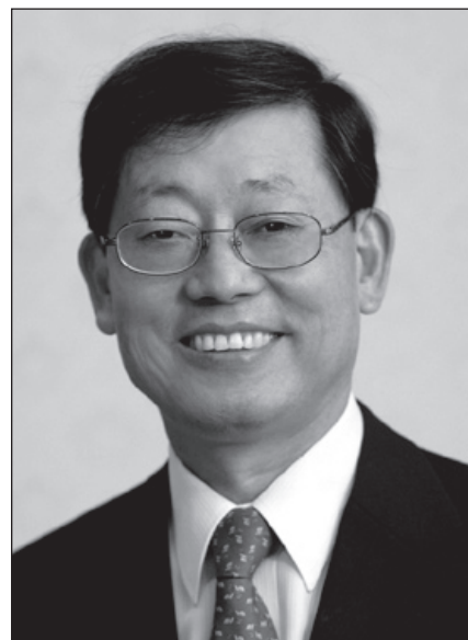
Hwang Sik Kim