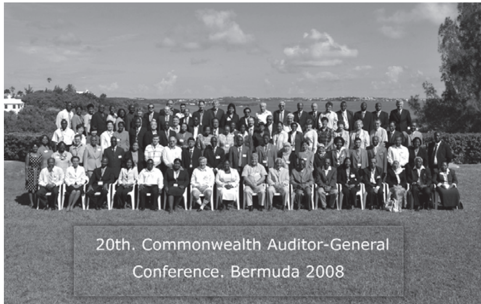
Participants in the Conference of Commonwealth Auditors General in Bermuda in July 2008

More than 45 Commonwealth SAIs were represented at the conference. Participants also included representatives from the United Kingdom Commonwealth Secretariat and observers from the INTOSAI Secretariat General, the Organization of American States (OAS), this Journal , and the Samoan SAI. The conference theme was Accountability for the 21st Century, and participants considered two primary topics under this theme: the powers and responsibilities of Commonwealth auditors general and supporting the scrutiny functions of parliaments and legislatures.