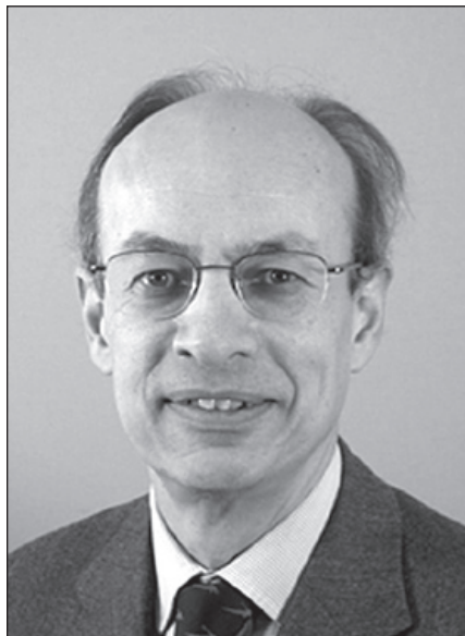
Gijs de Vries