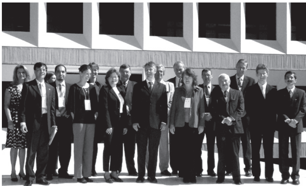
Participants in the Subcommittee on Performance Audit meeting in Brazil in May 2008.

The meeting agenda included presentations by the SAIs of Denmark, Brazil, France, and Australia and by IDI. The Brazilian SAI discussed the results of a mini-survey carried out to determine the audit phases and audit methods or techniques that should be addressed in new performance audit guidelines. The Danish delegates talked about the process for developing standards and guidelines and key Professional Standards Committee initiatives. The French delegate outlined the work of the INTOSAI Program Evaluation Working Group and how this work will relate to the PAS in the future. The Australian SAI described performance audit issues that are important in Australia and relevant to PAS. The IDI delegate addressed the current performance audit scenarios in different INTOSAI regions and related IDI strategies and actions.