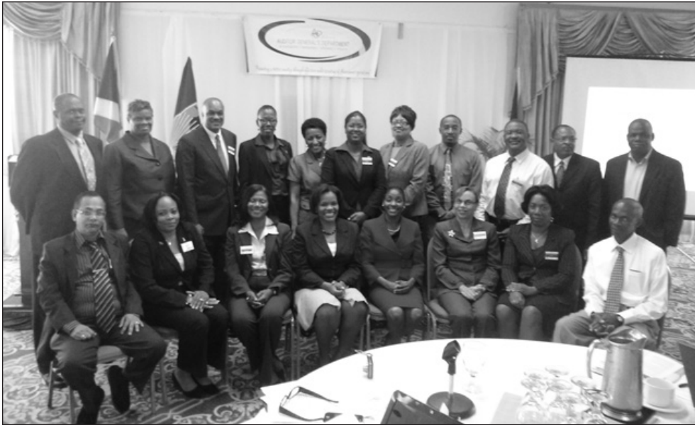
Participants in the CAROSAI strategic planning meeting in Jamaica.

The meeting was sponsored by the Inter-American Development Bank's PRODEV program and the INTOSAI Development Initiative (IDI).