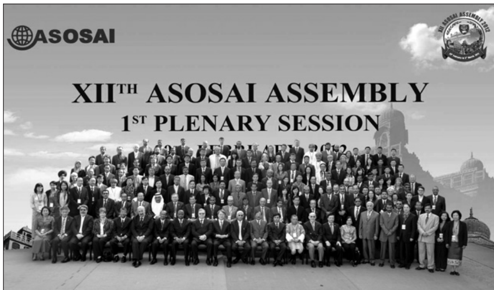
Participants in the 12th ASOSAI Assembly.

Capacity-building programs have been offered to member SAIs, including three ASOSAI-sponsored workshops on performance, environmental, and public debt auditing. IDI-ASOSAI cooperation launched two programs: Quality Assurance in Performance Audit in 2010 and Development and Implementation of the Strategic Plan in 2011. As of the assembly date, two workshops had been organized for each program.