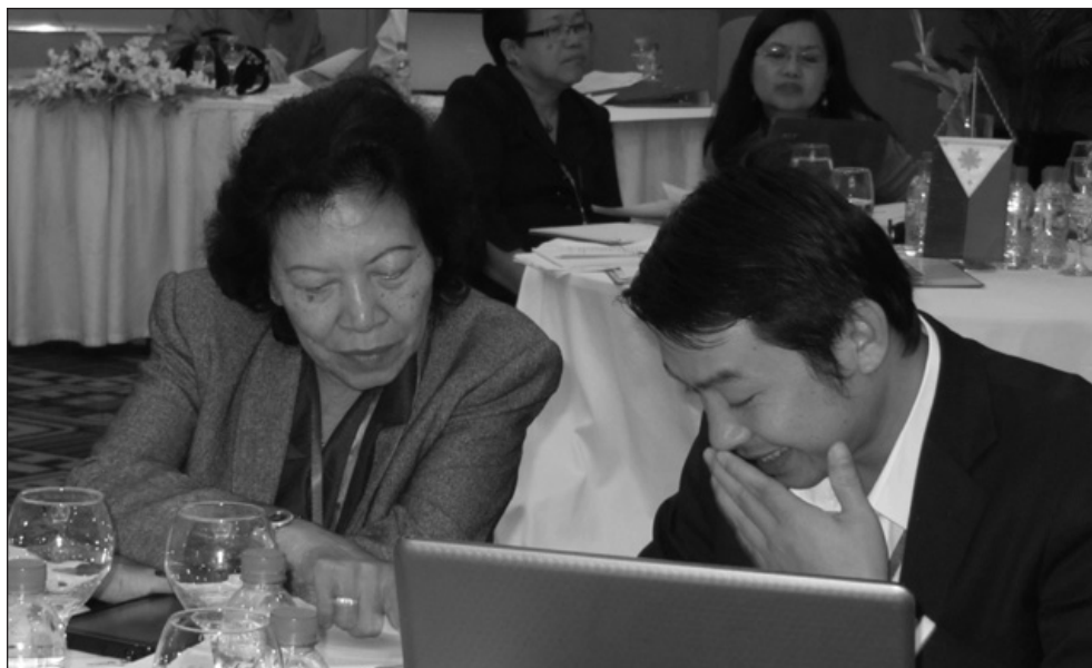
Members of the Laotian SAI took part in the Needs Assessment Workshop of the IDI/ASOSAI Strategic Planning Program.

In ASOSAI, the seven participating SAIs gathered for the Needs Assessment Workshop at the beginning of April. Following this workshop, the SAIs are to conduct needs assessments in their respective institutions that will later be presented for expert and peer review. After conducting needs assessments, the SAIs will reconvene for the Strategic Planning Workshop in September 2012.