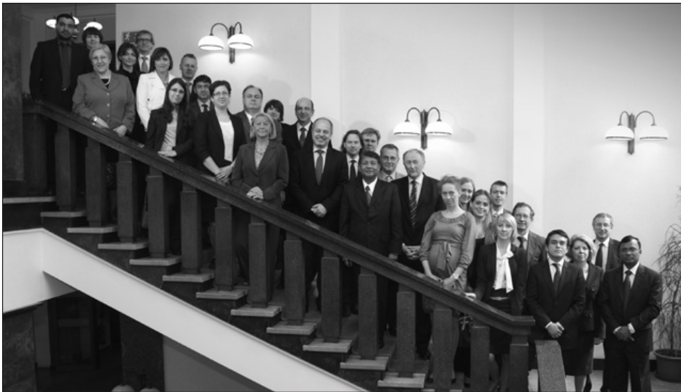
Participants in the April 2012 Subcommittee on Internal Controls meeting in Warsaw, Poland.

The Supreme Audit Office of Poland, which has chaired the subcommittee since the latest INCOSAI in November 2010, hosted the meeting. Representatives from the SAIs of 14 countries (Austria, Belgium, Bangladesh, Brazil, Chile, France, Georgia, Hungary, Lithuania, the Netherlands, Oman, Romania, Russia, and South Africa) attended the meeting, along with representatives of two organizations that have been cooperating with the subcommittee—the Institute of Internal Auditors (IIA) and the Committee of Sponsoring Organizations of the Treadway Commission (COSO).