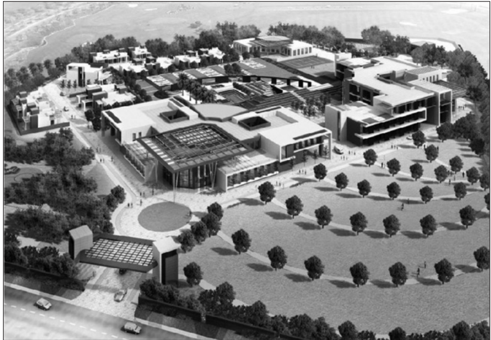
Model Showing Proposed Layout of the iCED

The need for an environmental audit training course for auditors, especially those undertaking environmental audits for the first time, has emerged repeatedly at several WGEA forums. Also, triennial environmental audit surveys of SAIs conducted by the WGEA have pointed out the need for such courses. In response, the WGEA, in partnership with the SAI of India, has decided to set up the International Center for Environmental Audit and Sustainable Development (iCED), a global training facility for environmental auditing to be located at Jaipur, approximately 250 kilometers from New Delhi, the capital of India. The first training is expected to take place in 2013.