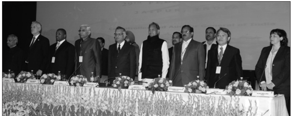
Dignitaries and officials participating in the opening ceremony of the 12th ASOSAI Assembly.